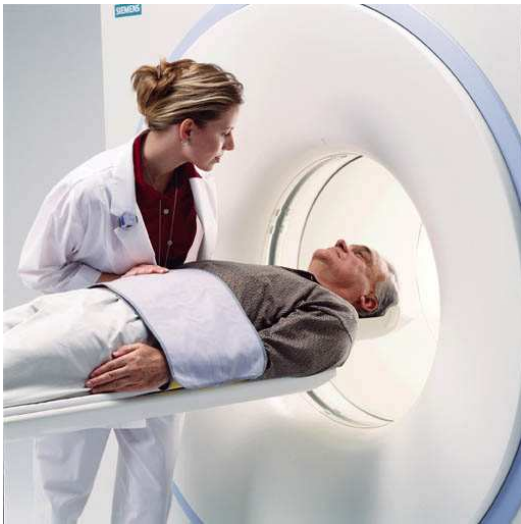
Fig. 2. Computed Tomography and other medical imaging modalities have allowed us to “see” inside the human body increasing the chances of detecting cancer and other diseases while there is still time.

body to identify diseases and other problems previously hidden from our eyes. Computed tomography, ultrasound, and nuclear magnetic resonance all provide different views into the body and facilitate the diagnosis of serious diseases such as cancer, heart disease, and other ailments. God's common grace through the engineering profession is clearly seen as lives are prolonged and the quality of life is improved by devices such as the CT scanner shown in Figure 2.